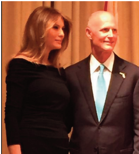
First Lady Melania Trump dropped by to greet Gov. Rick Scott at the VIP reception.