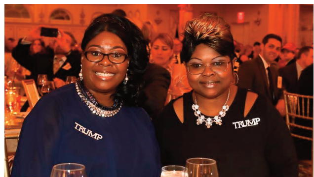
Diamond and Silk were entertaining, as always.

In closing I’d like to end on an amusing note that is nothing short of hilarious. The cover art for Friday night’s dinner program was a cleverly rendered drawing of President Abraham Lincoln wearing a red Make America Great Again baseball cap. Upon seeing this cover art, Chelsea Clinton, senior officer of a great American influence-pedaling charity foundation and daughter of Bill and Hillary, tweeted alarmingly: “Somebody please tell me this was Photoshopped!” If you don’t mind, I’d like to take this opportunity to waylay the fears of the former first daughter: Earth to Chelsea—DUH!!!!