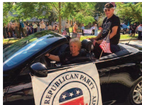
The Republican Party of Palm Beach County participated in the Veterans Day Parade in West Palm Beach on Sunday, November 5.