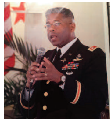
Col. Allen West will be the guest speaker at the Dec. 7 meeting.