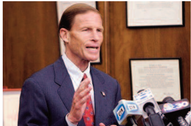
Senator Blumenthal, an ethics watchdog who lied about serving in Vietnam.

As you read this, the voters in Virginia will be filtering through the polling places to elect their next governor. Their choice is between Democrat Lt. Governor Ralph Northam and Republican Ed Gillespie. According to Democrat pundits, a Northam win will be a great victory—the first sign of the party’s re-emergence out of the shadows of political irrelevancy. Actually, a close win by Northam would have no great meaning for the future. Virginia—thanks to all those Washington bureaucrats living in the northern half of the state—has been pretty much of a blue state. It was carried by Obama twice and even Clinton in 2016. The outgoing governor is a Democrat. Now if Gillespie wins the race