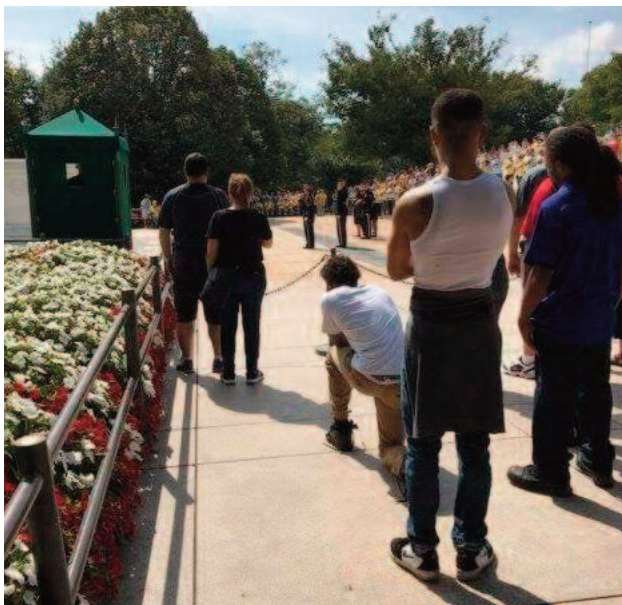
Taking a knee in disrespect at the Tomb of the Unknown Soldier in Arlington National Cemetery

And then there's the Redskins Josh Norman speaking out on "the tyranny of the POTUS" while he supports a guy who apparently admires the "tyranny" in communist Cuba! And by the way, Kaepernick is upset because he supports the Black Lives Matter movement, which is part of the