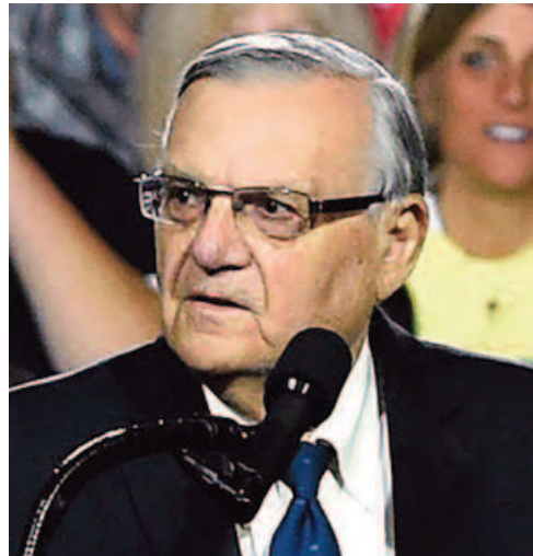
Sheriff Joe Arpaio

So let's get back to Sheriff Joe. The initial racial profiling suit that led to his conviction was political prosecution. The