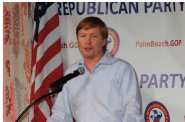
Florida’s Commissioner of Agriculture Adam Putnam