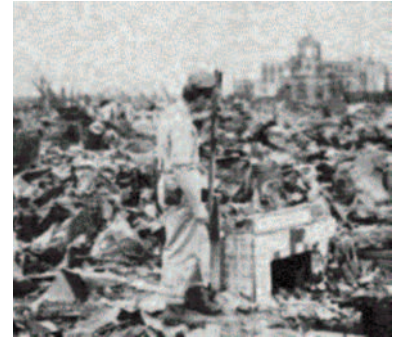
Hiroshima—72 years later