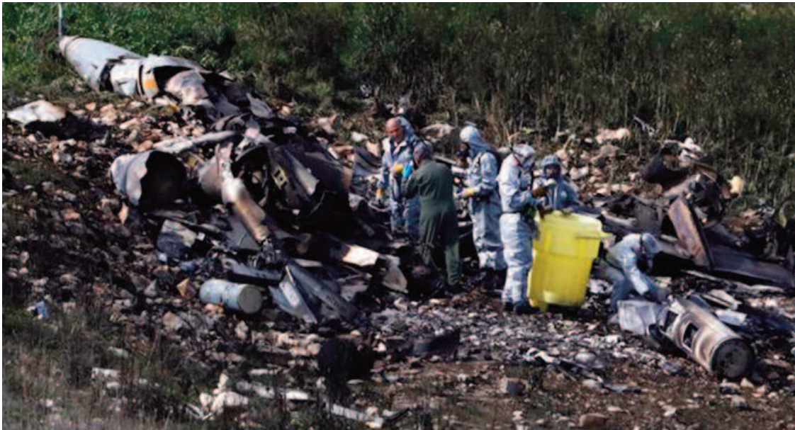
Israeli forces examine the remains of an F-16 fighter jet

So, according to the Russkies who invaded and are responsible for hundreds of thousands of fatalities in Syria, Israel is somehow complicating the situation by counterattacking its enemy who initiated the conflict and is threatening the Jewish State's destruction? How can a nation, a victim of armed aggression by another state not respond and protect its citizens from being annihilated? Did Russia not respond to Nazi Germany with a fierce military force in 1941 to destroy its enemy? Again, we hear the same old mantra from Israel haters for it to appease its enemies, to stand with hands at sides and beg for mercy. Six and one half million of our people did that in Europe. Meanwhile the Allies were destroying Germany not with pleas for restraint, but with deadly and punishing force. Our suggestion to our Israeli cousins is to treat their enemies like we did in WWII. Enough with playing defense. Without a strong offense, a team is a loser.