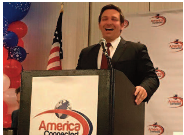
Congressman Ron DeSantis was the keynote speaker for the Statesperson Dinner.

York City Mayor Rudy Giuliani. Cong. DeSantis noted that the tax cut bill recently passed by Congress is already helping more than was expected to this point. He also addressed the Valentine’s Day shooting at Marjory Stoneman Douglas High School in Parkland, commenting that the bureaucracy failed us in this instance and needs to accept its share of the blame. He also suggested tightening background checks and making the schools more secure.