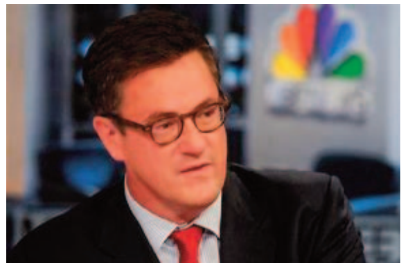
The Morning Schmo

They call it “The Morning Joe” show, but it should be “The Morning Shmo” show. Let’s hope Scarborough and Schumer finally wake up and get us a message worth hearing during this National Emergency. It would be better late than never.