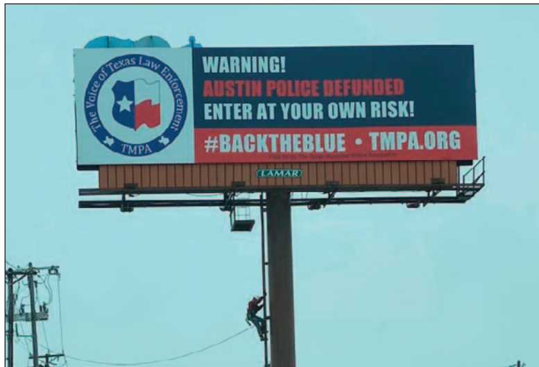
Thank you to the Texas Municipal Police Association for this great new billboard that went up in Austin today. @austintexasgov ignored public safety and made a dangerous decision to #defundpolice #bigmistake #backtheblue #txlege